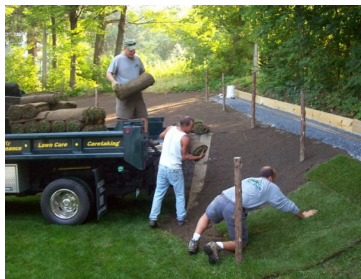
Rising Sun Maintenance crew sodding the hillside for the Incline Railroad installation