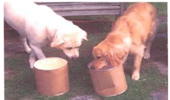
Two members of the cleanup crew after the Ice Cream Social